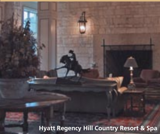
Hyatt Regency Hill Country Resort & Spa

Hotel rooms have been blocked at special rates, on a space available basis. To make a reservation, contact the hotel and indicate you are attending the State Bar of Texas Water Rights Course.